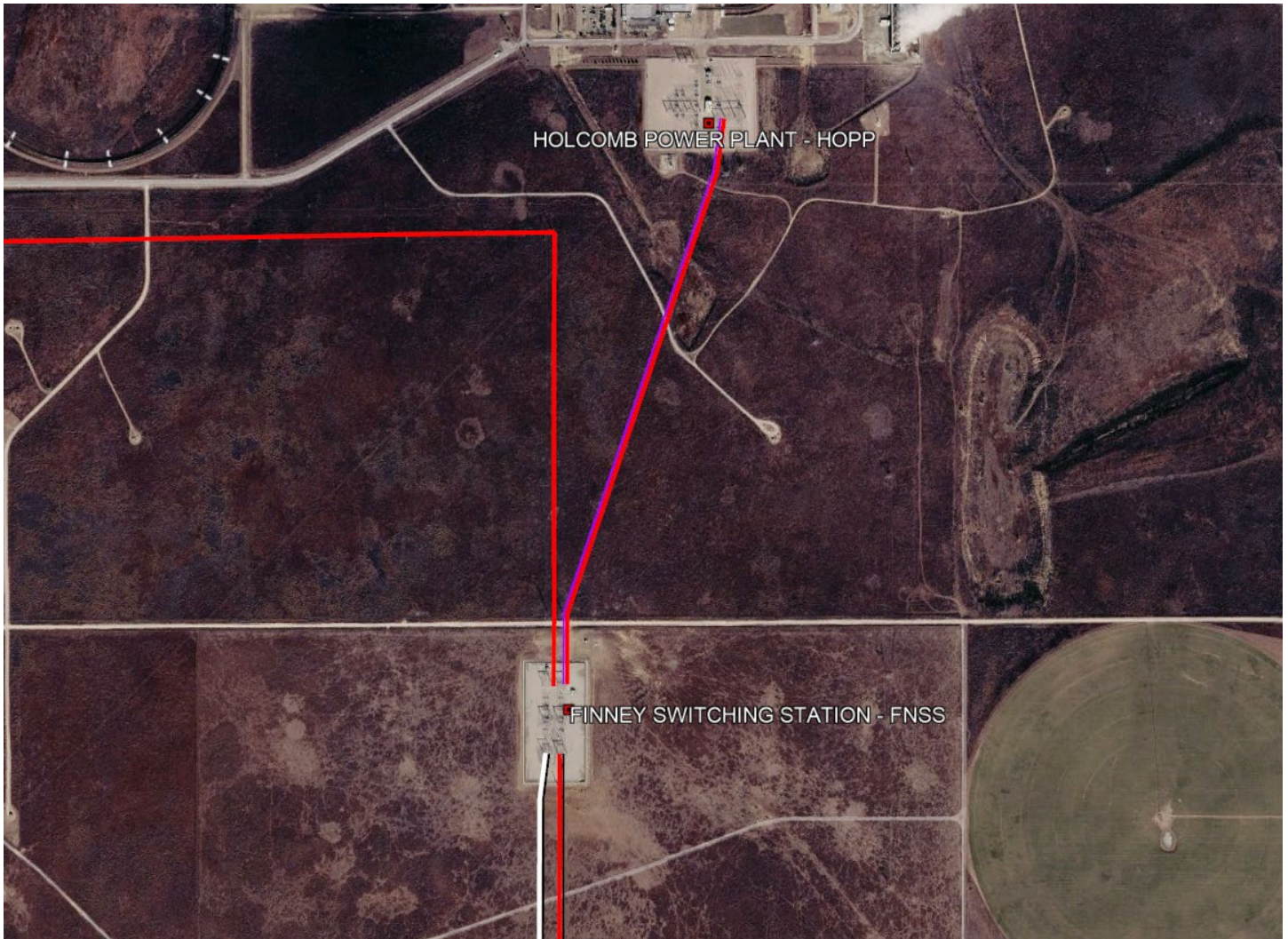
Figure A-1: General vicinity location map of the Finney Substation

SPS 345 kV transmission lines shown in red, earlier customer's gen-tie line shown in white.