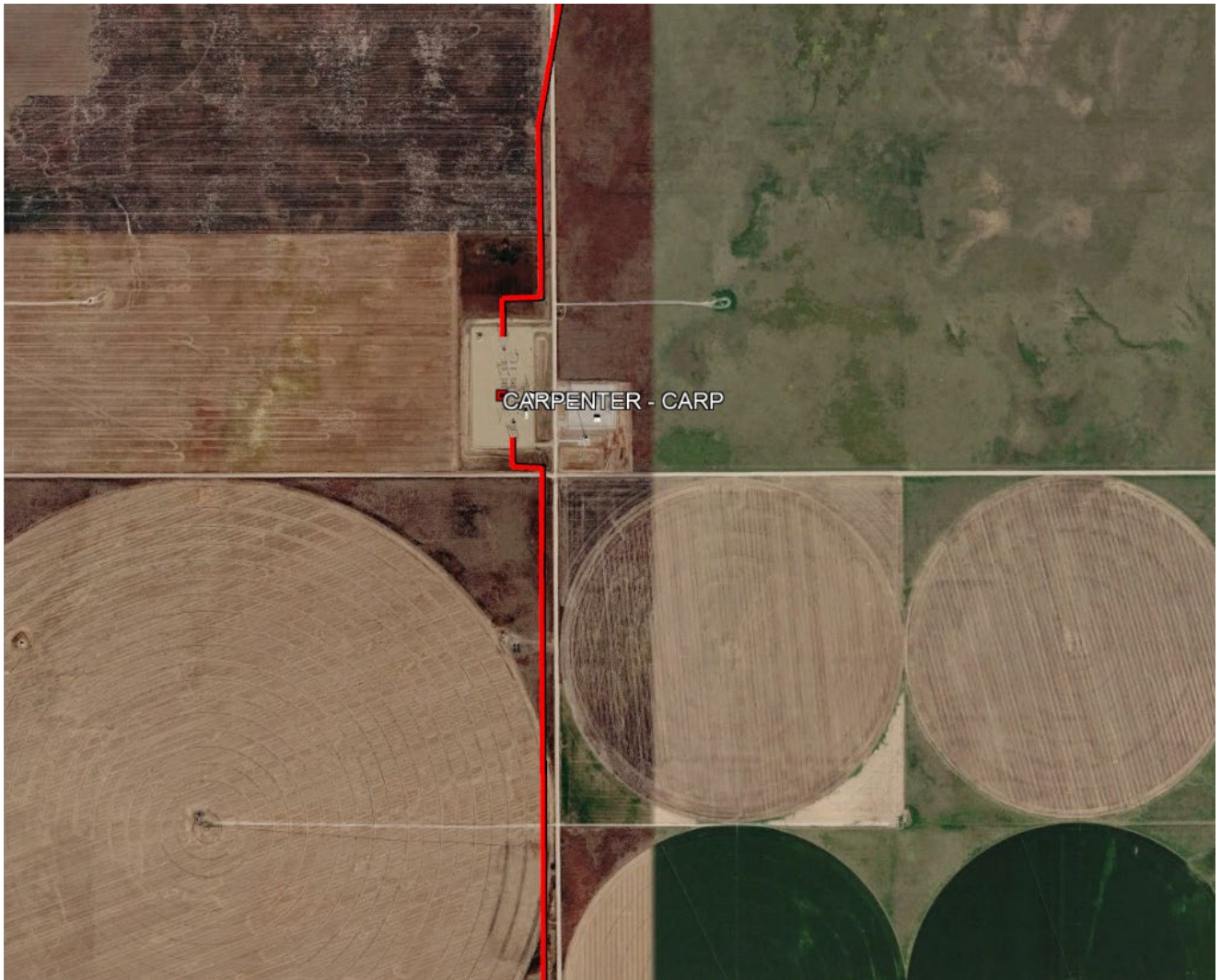
Figure A-1: General vicinity location map of the Carpenter Substation

SPS 345 kV transmission lines are shown in red.